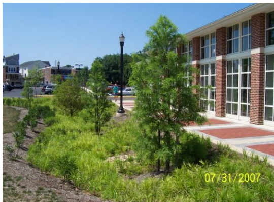
Rain garden at Woodlawn Library in Wilmington, DE