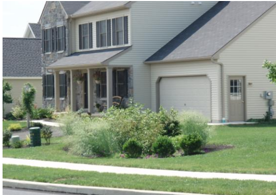
Residential rain garden at the Village at Springbrook Farm in Lebanon, PA