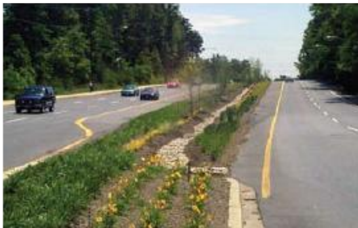
Linear bioretention area along roadway