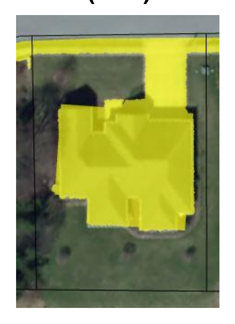
Single Family Residential (SFR)