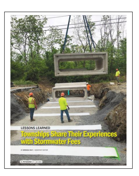
PA State Association of Township Supervisors – July 2021 PA Township News

https://support.cwqe.org/article/186-paying-for-green-infrastructure