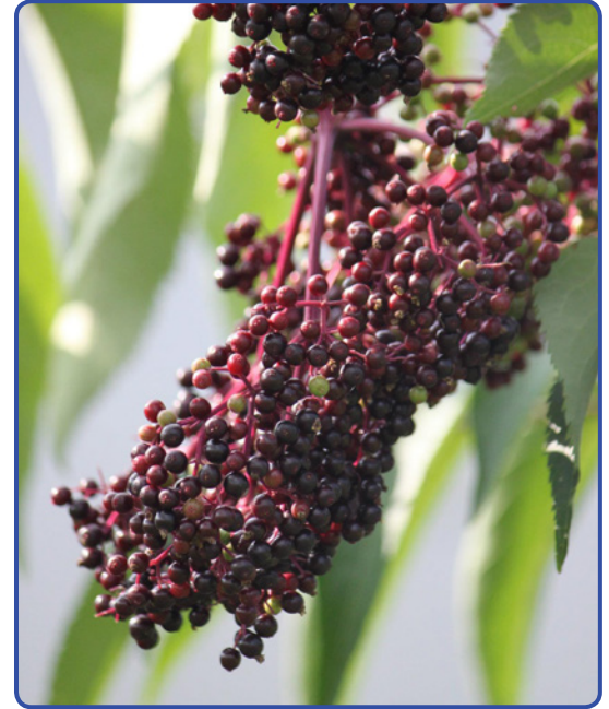
▲ Elderberries can be a component of multifunctional riparian forest buffers.

Riparian buffers planted with a rich diversity of native fruits, nuts, and florals offer the grower a special connection with local tradition, culture, and folklore. Pawpaws, for example, are rarely found on supermarket shelves, but have long been a delicacy. Older fans of pawpaws may buy them at farmers markets to savor a taste from their youth, while those new to pawpaws might further their appreciation of the land where they grow wild. American persimmon, when tasted at peak ripeness in the late fall or early winter, has an unparalleled flavor and is a traditional