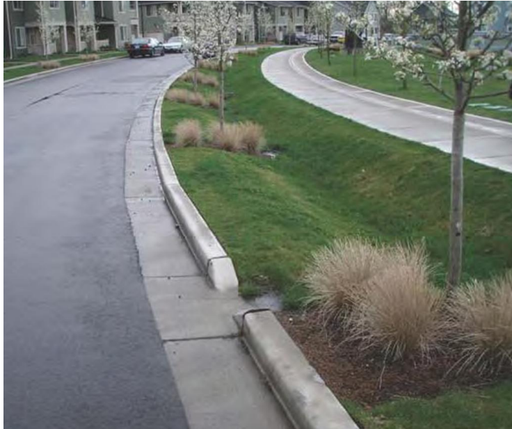
Curb opening to grass swale in residential development