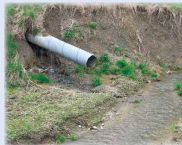
Stormwater pipe discharging directly to a stream