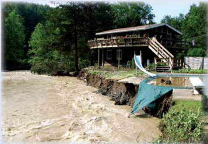
Effects of building in a floodplain and the consequences this brings

In the past, we have developed on our floodplains. We then tried to control stormwater by keeping it out of the floodplains. This practice causes water to overflow riverbanks in other locations – often creating floods of a greater magnitude and danger. Building on floodplains increases the risk of property damage and life threatening situations. Diverting stormwater into channels forces water to flow faster. This greater velocity destroys habitats and causes greater erosion including the loss of valuable topsoil thus creating a need for increased fertilizer use.