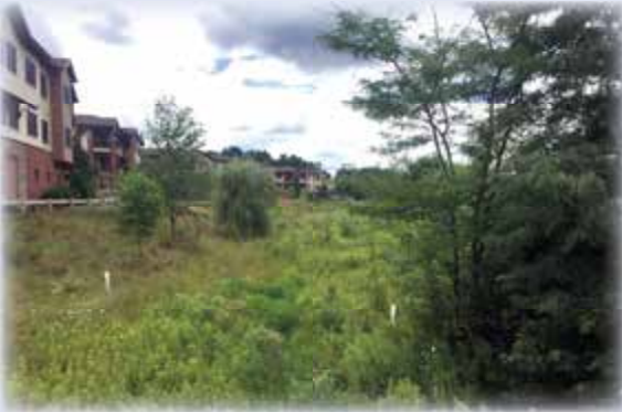
Wetland areas allow stormwater runoff to soak into the ground

Stormwater runoff may be carried through natural or manmade drainage ways or conveyance systems. In some cases stormwater runoff leaves a site and then spreads out over a large dispersed area as “sheet flow.” It may also be conveyed through ditches, swales, and natural drainage features. In most developed and urbanized areas, stormwater is conveyed through a system of catch basins, drainage basins, or storm drains.