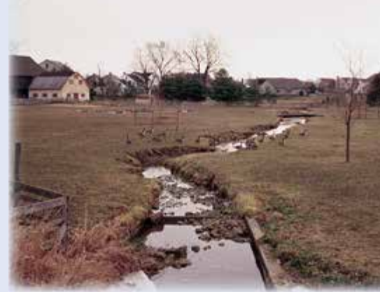
Example of removal of vegetation & stream straightening