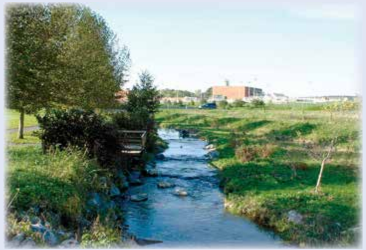
Above: Example of floodplain area