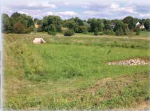
Stormwater detention basin