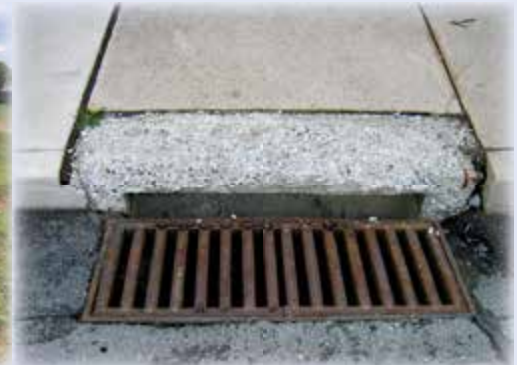
Storm drains are the common stormwater conveyance system in urban areas

We often forget stormwater runoff collects everything on the surface of roadways, sidewalks, parking lots, constructions sites, business parks, rooftops, etc. and carries it to storm drains or ditches which often empty to our local rivers and streams. As it flows, stormwater runoff collects and transports soil, pet waste, road salt, pesticides, fertilizers, oil, debris, and other potential pollutants.