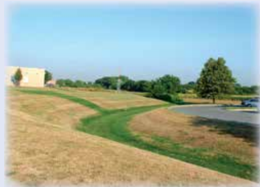
Vegetated stormwater swale