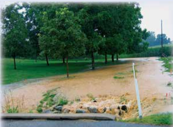
Stormwater runoff carrying sediment & other pollutants

The quality is affected by a variety of factors and depends on the season, local weather, geography, and activities throughout the watershed. Increased quantity of stormwater usually means decrease quality of our local streams.