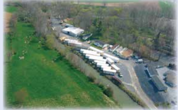
Example of floodplain development & potential safety issues